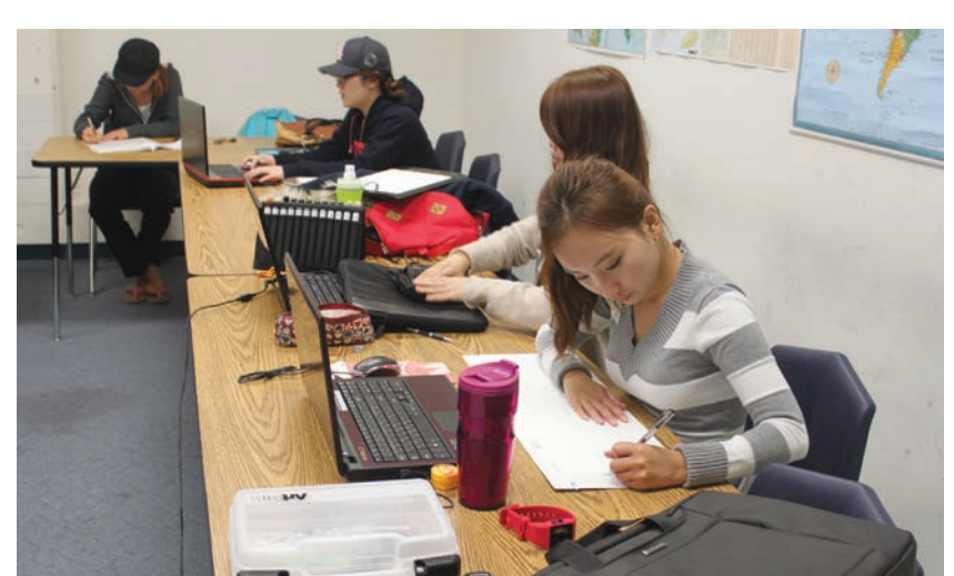
Art & design track students are studying hard in class.

anseo University has sent 50 students of College of Arts to the Long Beach Language Institute. The students are participating in a program which aims to nurture experts from March 7, learning their major and English, and taking an internship at the institute and Hancock University. The program has two tracks of art & design and hospitality, lasting 25 weeks and 41 weeks respectively.