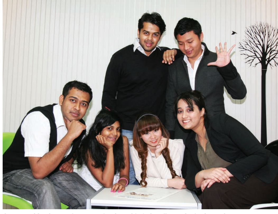
A group of foreign students are chatting with their colleges in the fraternity room.

These days, virtually every sector of our society including economy, business, fashion, music and sports is being