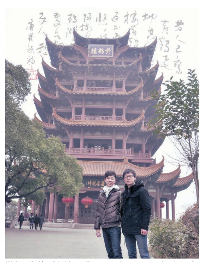
Writer (left) with his colleague take a souvenir photo in front of the pagoda.

Suzhou is recognized as a beautiful city among Chinese people, because it has many tourist destinations where the cultural artifacts of the Tang Dynasty are well preserved.