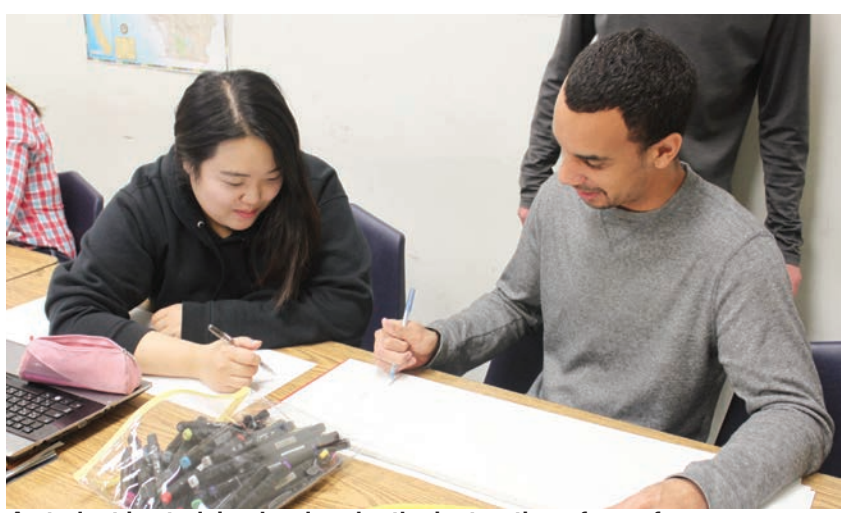
A student is studying hard under the instruction of a professor.