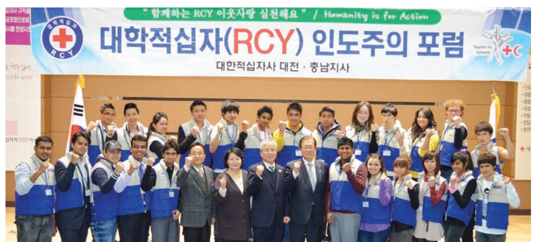
Hanseo's International Red Cross students with full smile pose at auditorium of Red Cross Chungnam.