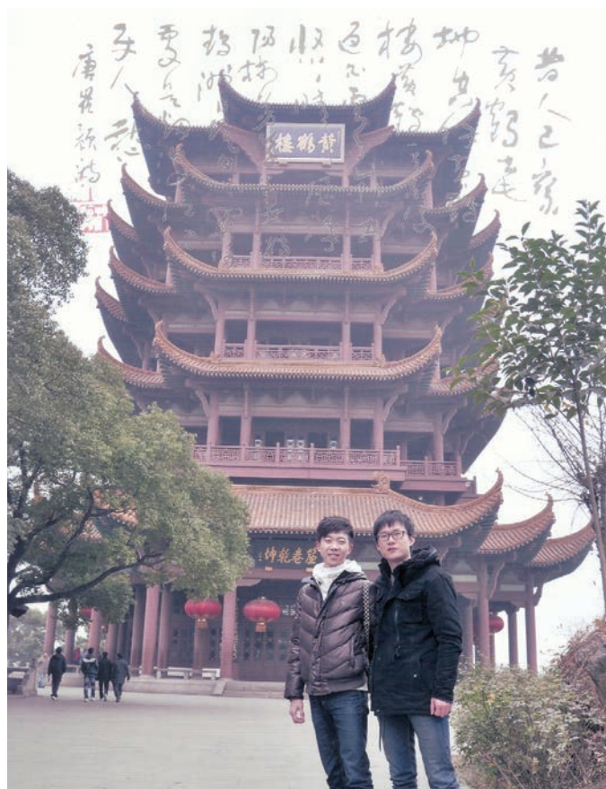
Writer (left) with his colleague take a souvenir photo in front of the pagoda.

and CI. Watching the process of setting a deadline, doing works and get confirmation in the same way we implement a project in Korea, I realized design process was about the same in China. The atmosphere was cozy and quiet. We had to bring our own notebook computers and without them, we could not do anything. Near the workplace was a relatively large Koreatown where Korean banks such as Woori Bank, Industrial Bank of Korea and Kookmin Bank are hosted. It can be convenient if you bring a card that can be used in China. Food was not good taste and expensive there. I ate Korean food only when I sometimes missed Korea. Suzhou is recognized as a beautiful city among Chinese people, because it has many tourist destinations where the cultural artifacts of the Tang Dynasty are well preserved.