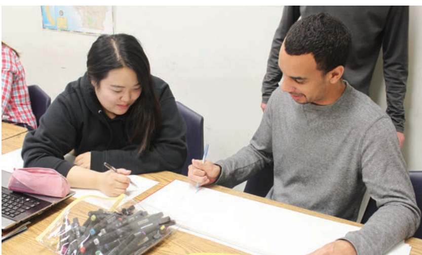
A student is studying hard under the instruction of a professor.