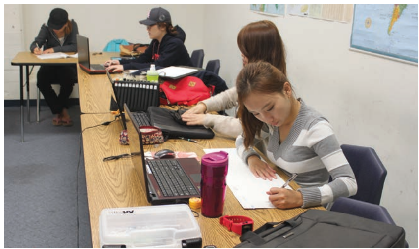
Art & design track students are studying hard in class.

Hanseo University has sent 50 students of College of Arts to the Long Beach Language Institute. The students are participating in a program which aims to nurture experts from March 7, learning their major and English, and taking an internship at the institute and Hancock University. The program has two tracks of art & design and hospitality, lasting 25 weeks and 41 weeks respectively.