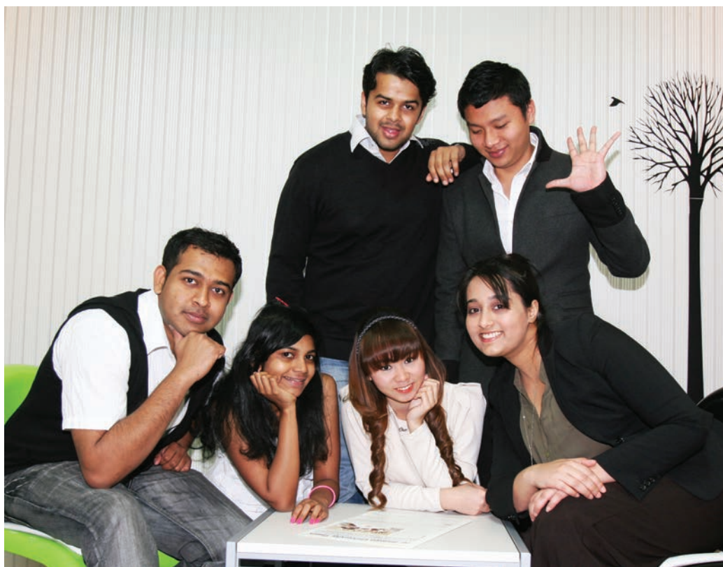
A group of foreign students are chatting with their colleges in the fraternity room.

These days, virtually every sector of our society including economy, business, fashion, music and sports is being